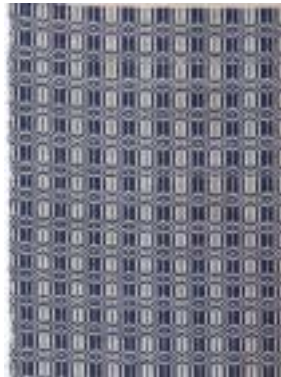
Angie's Quaker Ladies