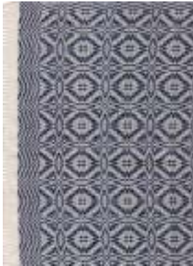
Marty's Maltese Cross