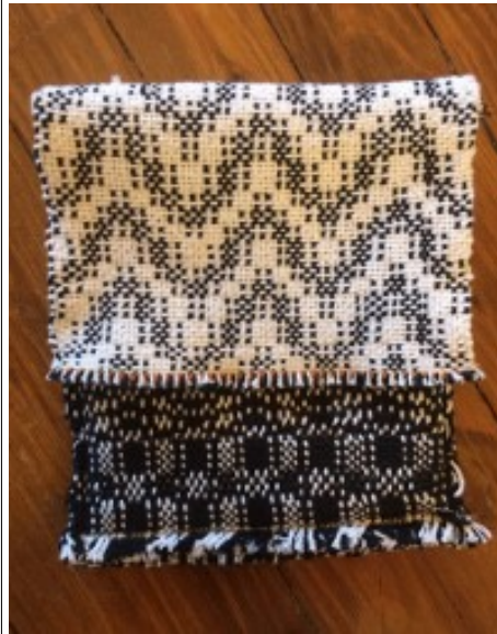
Bev laptop case