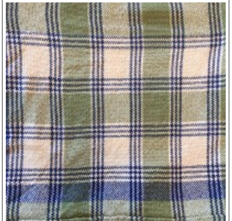
Roberta baby blanket