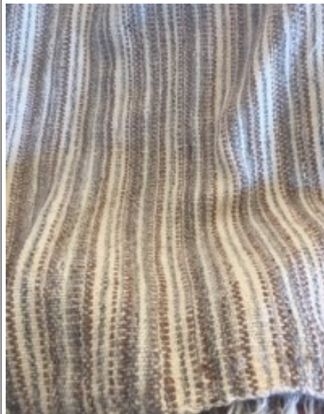
Roberta ruana close-up