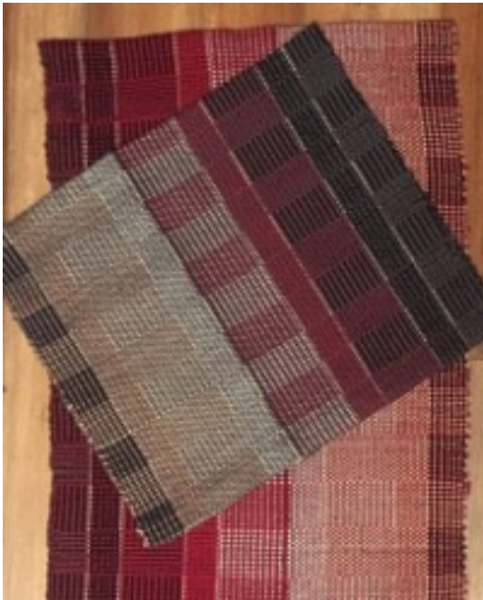
Genny - placemats